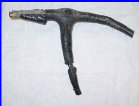
Bad cable found before it failed!