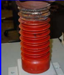
Active Partial Discharge & tracking found; before failure occurred!